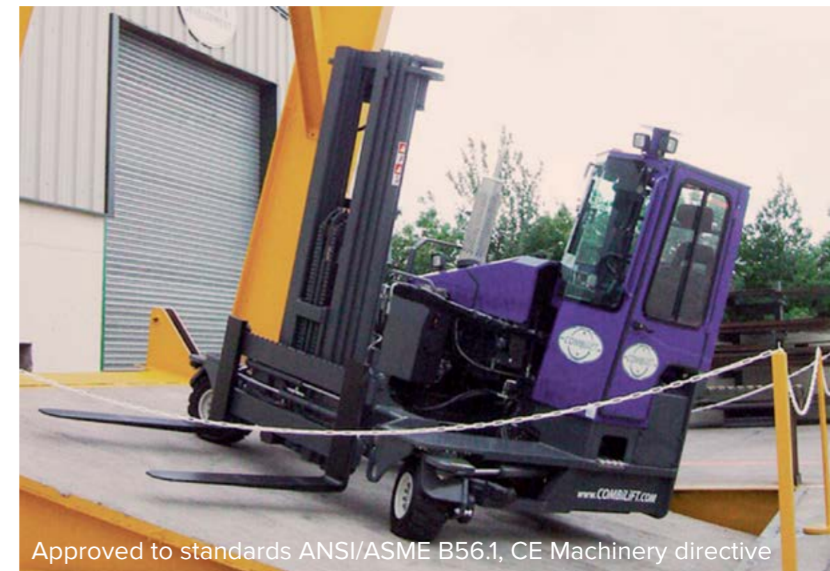
Approved to standards ANSI/ASME B56.1, CE Machinery directive