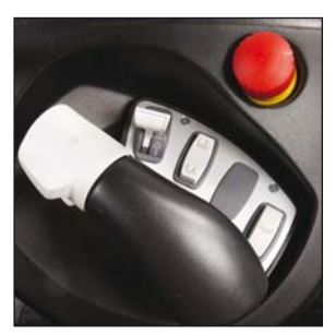
User-friendly joystick control