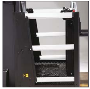
Smooth, lightweight gates