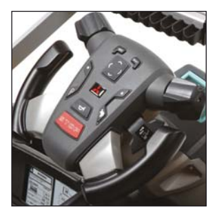
Maxius steering wheel