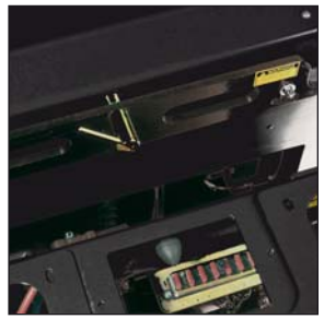
Easy service access