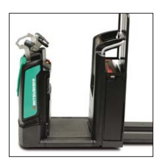
Spacious operator compartment