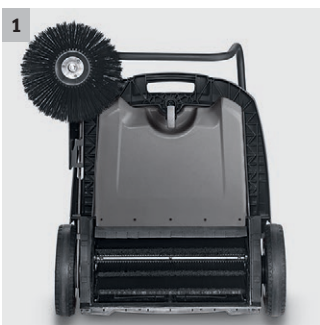
1 Main roller brush drive