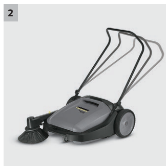
2 Adjustable push handle