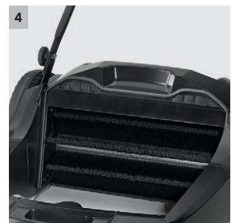
4 Dust filter