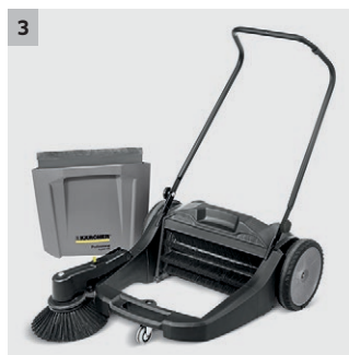
3 Large dirt container