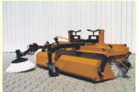
bema 20 forklift mounting with wheel levelling (hydr. side brush, 3rd support wheel)