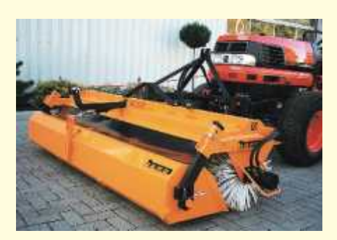
bema 20 Tractor mounting with 3 point front mounting